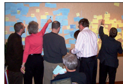
Participants identified room-wide themes and collective priorities.

Over 50 tables of up to 10 participants each engaged in small group dialogue, sharing and hearing each other's perspectives and opinions. Then with the support of the "theme team" rapidly reading and synthesizing ideas from the tables, participants identified room-wide themes and collective priorities. They were aided by keypad polling equipment, regional maps and a participant guide, which described important issues within NIRPC's planning domains as well as related quality of life topics. The overall process flowed with the assistance of more than 80 table facilitators, computer technicians, theme team members, data analysts, greeters, volunteers and staff.