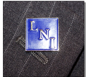
Do you know where your pin is?

Take pride in your accomplishment and help share the experience with others!