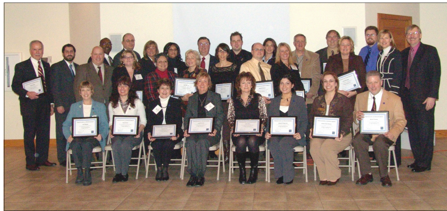
The LNI 22 graduating class participated in the quarterly Quality of Life meeting at the Purdue North Central in Westville on Dec. 6, 2007 as part of its final session.

CFO & VP Finance Edgewater Systems for Balanced Living